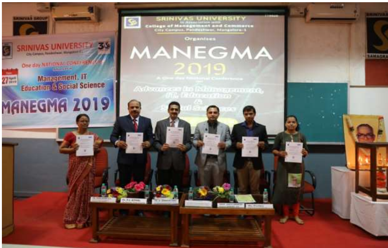
MANEGMA-2019, One day National Conference at Srinivas University